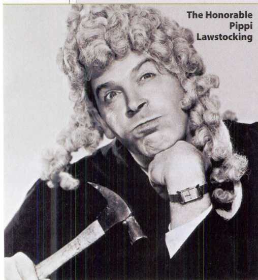
The Honorable Pippi Lawstocking