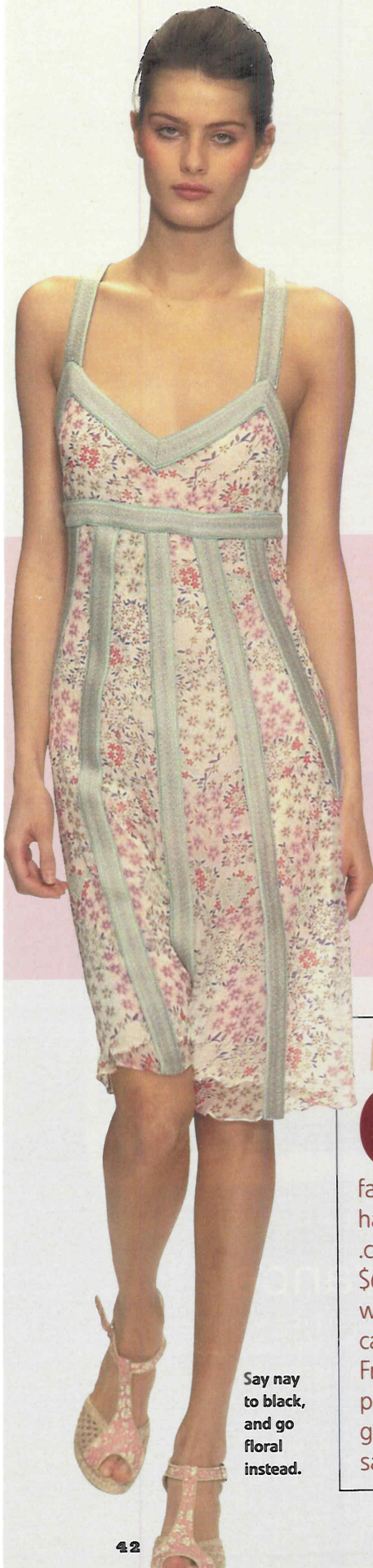
Say nay to black, and go floral instead.